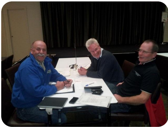
Getting some planning done in preparation for the coming championships