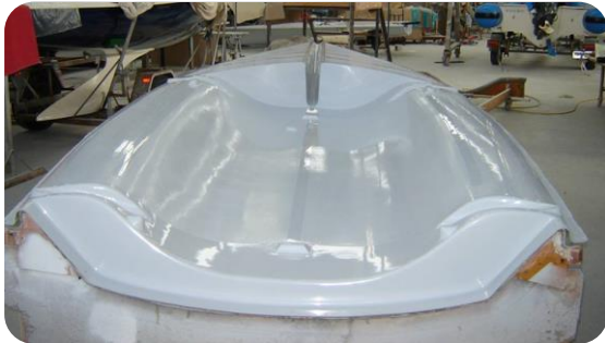
A shot from the construction phase at the Sly Boats factory

As mentioned in the presidents report following a number of boat shuffles owners have made the decisions to build new replacements. Constructed in the Sly Boats factory in Victoria, the new boats are a great sign of staying fresh as a class and movement in the second hand market in the lead up to the Nationals has been promising.